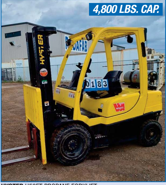
HYSTER H50FT PROPANE FORKLIFT