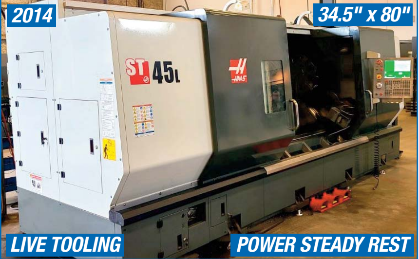
HAAS ST-45L CNC LATHE