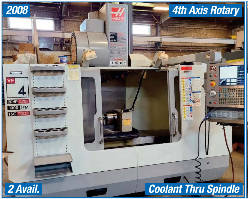
HAAS VF-4B CNC VERTICAL MACHINING CENTER