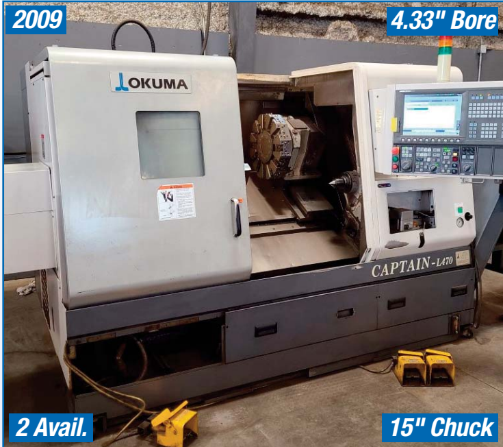
OKUMA CAPTAIN L470 CNC LATHES