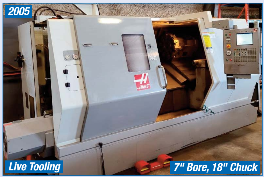
HAAS SL40TB BIG BORE LATHE