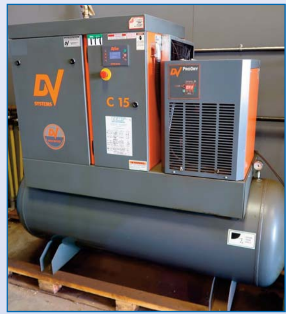
DV SYSTEMS C-15TD AIR COMPRESSOR