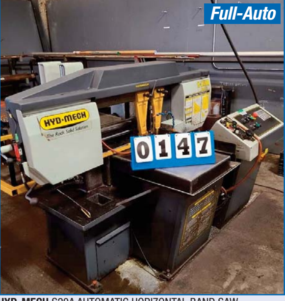
HYD-MECH S20A AUTOMATIC HORIZONTAL BAND SAW