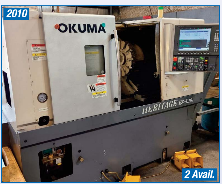
OKUMA HERITAGE ES-L10 II CNC LATHES