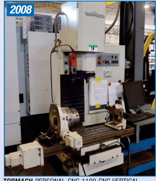
TORMACH PERSONAL CNC 1100 CNC VERTICAL MILLING MACHINE

2008 TORMACH Personal CNC 1100 CNC Vertical Milling Machine, 34" X 9.5" Table, PC based cnc control. 4th Axis Rotary Table